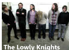
The Lowly Knights