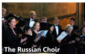
The Russian Choir