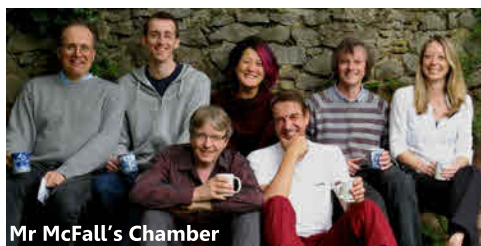
Mr McFall's Chamber