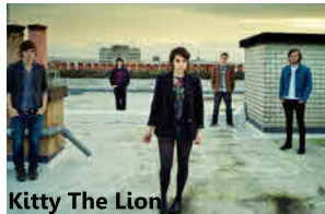
Kitty The Lion